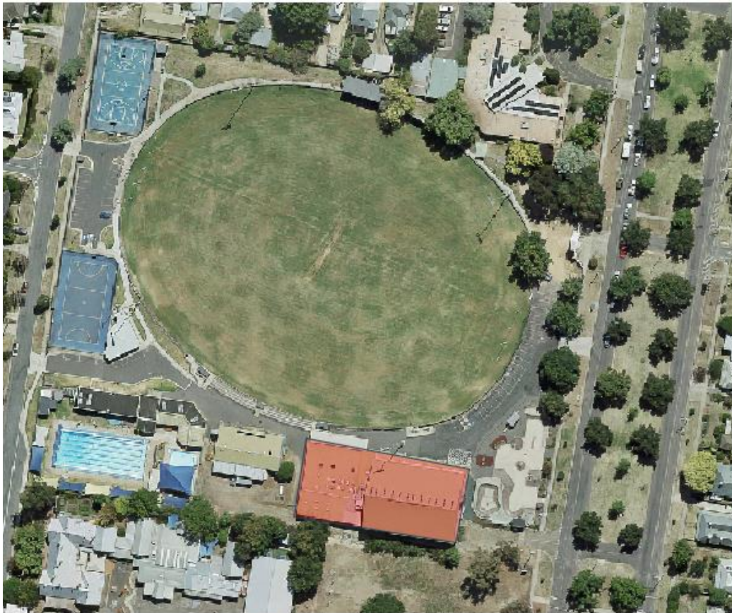
Figure 1: Pozi - Aerial View of 35 Highett St, Mansfield (highlighted in red)