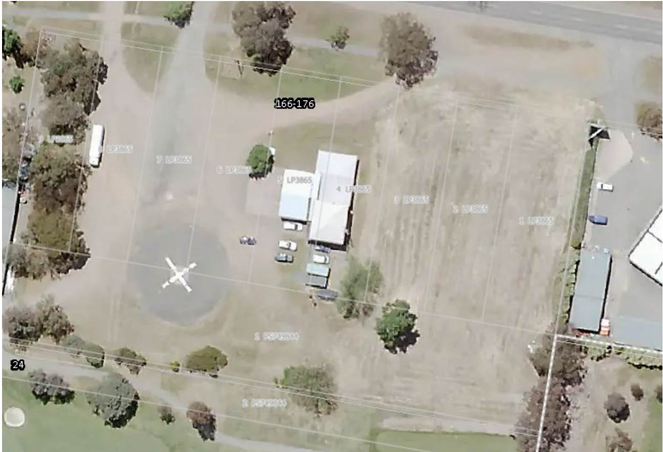
Figure 1: Mansfield Emergency Station Precinct location

That part of the land described in Certificate of Title Lots 4 & 5 Volume 11898 Folio 997, being the property situated at 66-176 High Street, Mansfield, 3722.