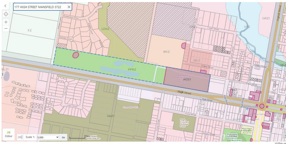
Site context.