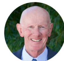
Cr Mark Holcombe, Mayor