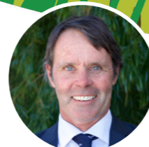
Cr James Tehan, Deputy Mayor