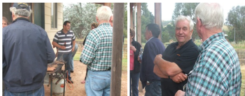
The Landcare BBQ